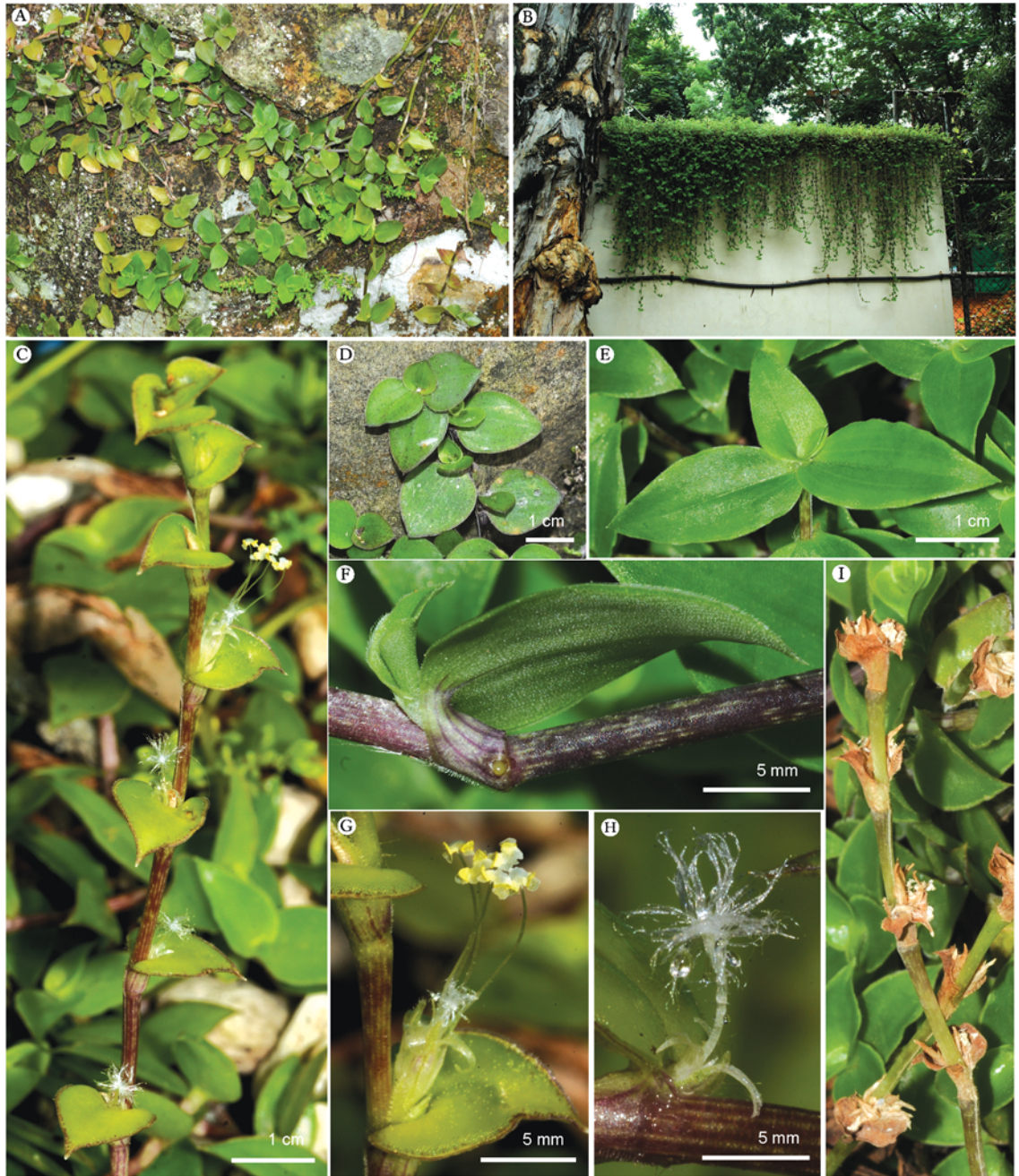
Figure. 2. Callisia repens (Jacq.) L. A. Habitat (on stone wall) B. Habitat (on roof) C. Habit D. E. Leaves F. Leaf sheath G. Bisexual flower H. Pistillate flower I. Infructescence