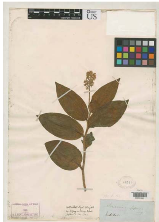
Figure 4. Type specimen of Smilacina japonica A. Gray., get from website of Smithsonian National Museum of Natural History (NMNH).