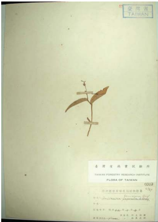
Figure 3. Type specimen of Smilacina formosana Hayata (syntype, TAIF!).